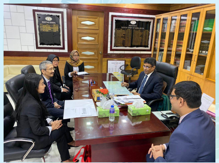
Meeting with General Registrar of the Supreme Cort of Bangladesh

This newsletter is dedicated as an instrument to spread the updated information regarding the completed tasks done by the SPC during January—September 2020. By the time this newsletter is disseminated to all member countries of AACC, several tasks have been completed such as below.